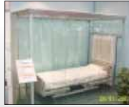
HOSPITAL ISOLATOR BED SYSTEM