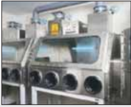
BIO-HAZARD ISOLATOR CLASS 3A