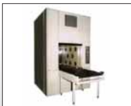
AIR-SHOWERING PASS BOX