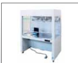
BIO-HAZARD CLEAN BENCH