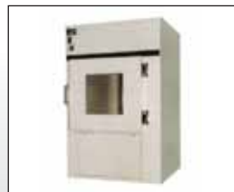
LAMINAR FLOW PASS BOX