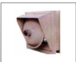
PRESSURE RELIEF DAMPER