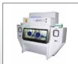
BIO-HAZARD ISOLATOR BL-3