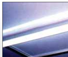
TEAR DROP LIGHTING