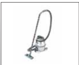
CLEANROOM VACUUM CLEANER