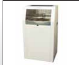
CLEANROOM WASHER & DRYER