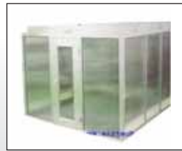
CLEAN BOOTH-CLASS 10